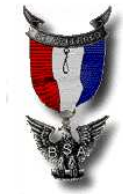
Figure 2 Eagle Rank

Details for advancement are contained in the Boy Scout Handbook, which every Scout should obtain as soon as possible after joining the Troop. Take a look at Chapter 1. This short chapter has an advancement summary through First Class.